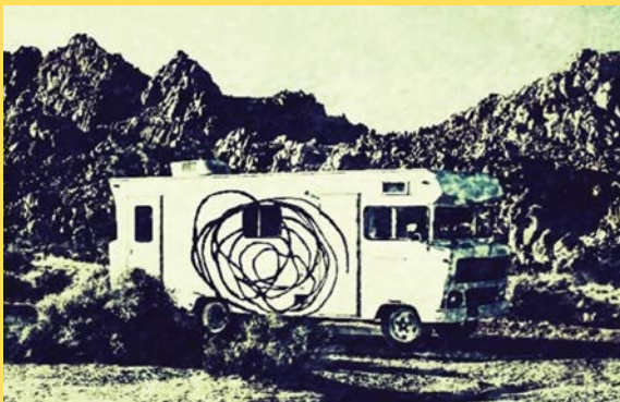
THE BIG READ ART CAPSULE