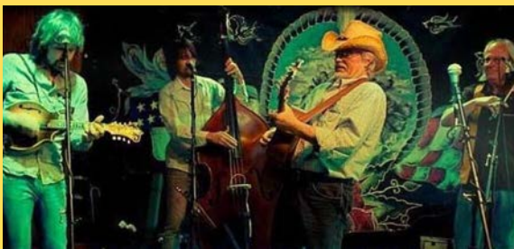
MUSIC BY SHADOW MOUNTAIN BAND