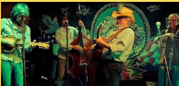
MUSIC BY SHADOW MOUNTAIN BAND