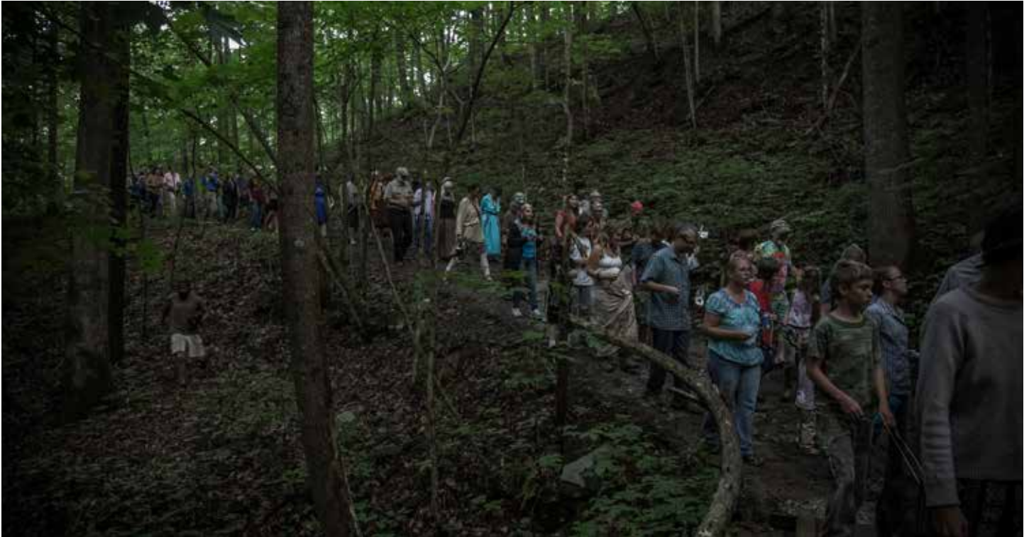
Clear Creek Festival, Rockcastle County, KY.