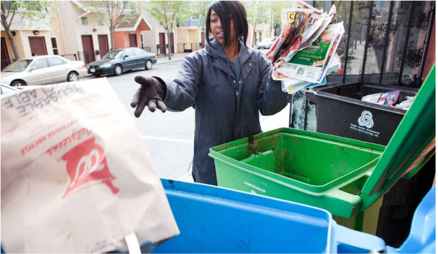
A Green Streets participant sorts recyclables in the Western Addition neighborhood of San Francisco, CA.