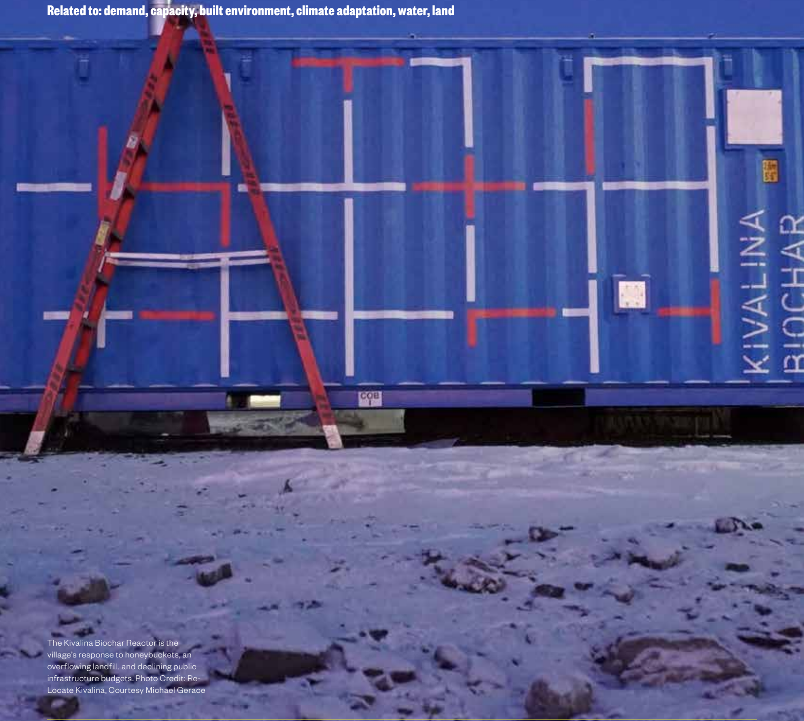
The Kivalina Biochar Reactor is the village's response to honeybuckets, an overflowing landfill, and declining public infrastructure budgets.

Related to: demand, capacity, built environment, climate adaptation, water, land