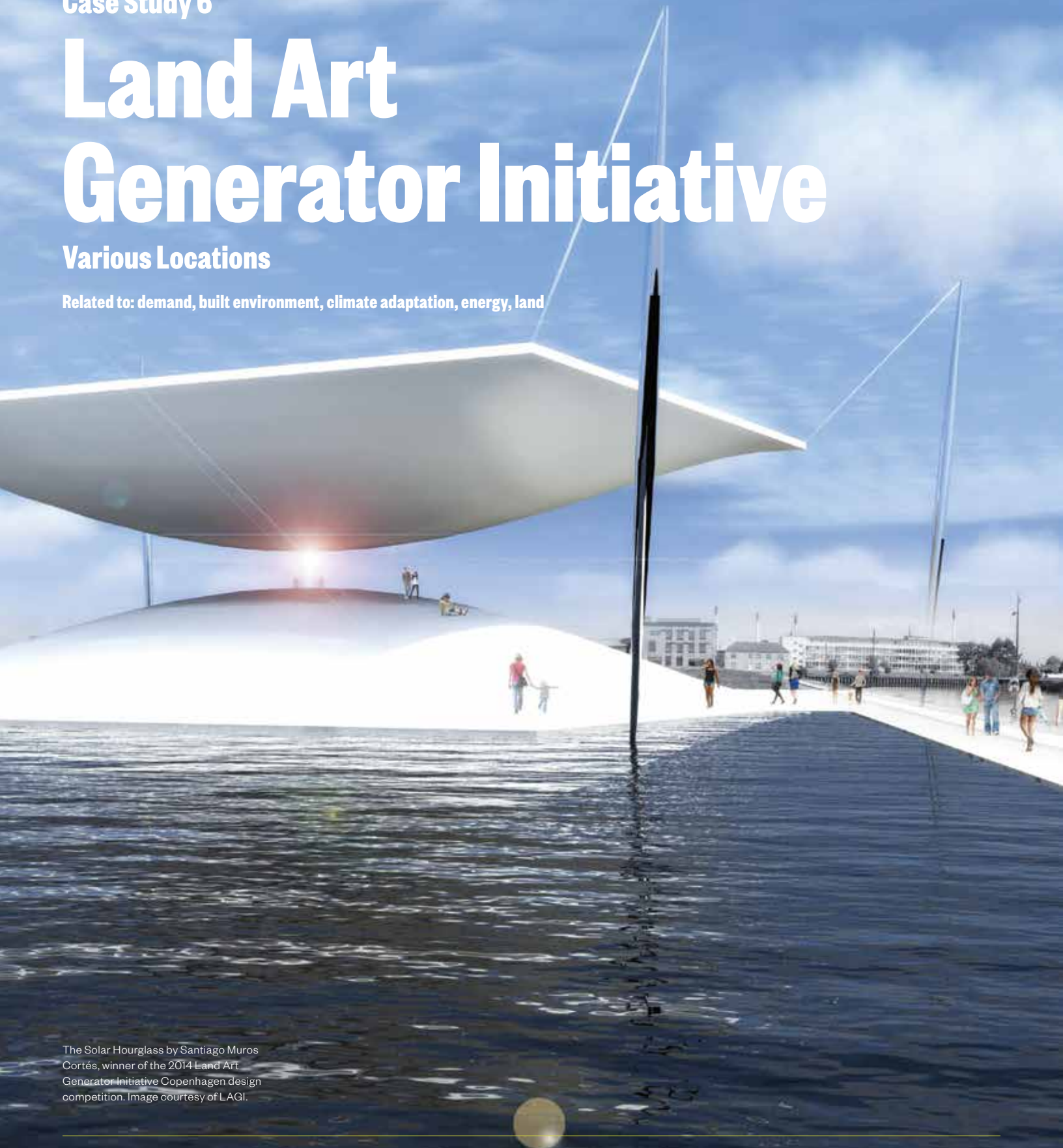
The Solar Hourglass by Santiago Muros Cortés, winner of the 2014 Land Art Generator Initiative Copenhagen design competition.

Related to: demand, built environment, climate adaptation, energy, land