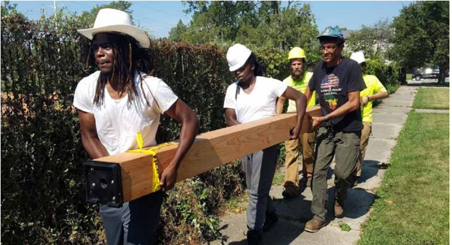
In the spirit of a traditional barn raising, more than 50 volunteers joined Sweet Water Foundation staff and expert tradesmen from Trillium Dell Timberworks to manually raise “The Thought Barn,” a central part of Perry Avenue Commons in Chicago, IL.