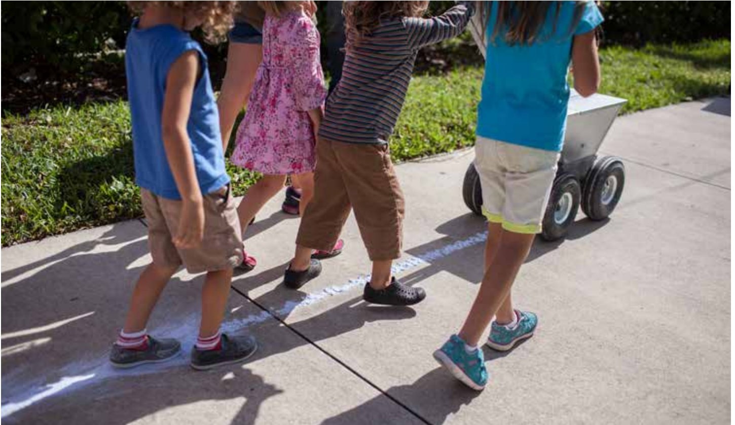
Local kids chalk 6ft sea level rise line for HighWaterLine, Biscayne Blvd, Miami, FL.