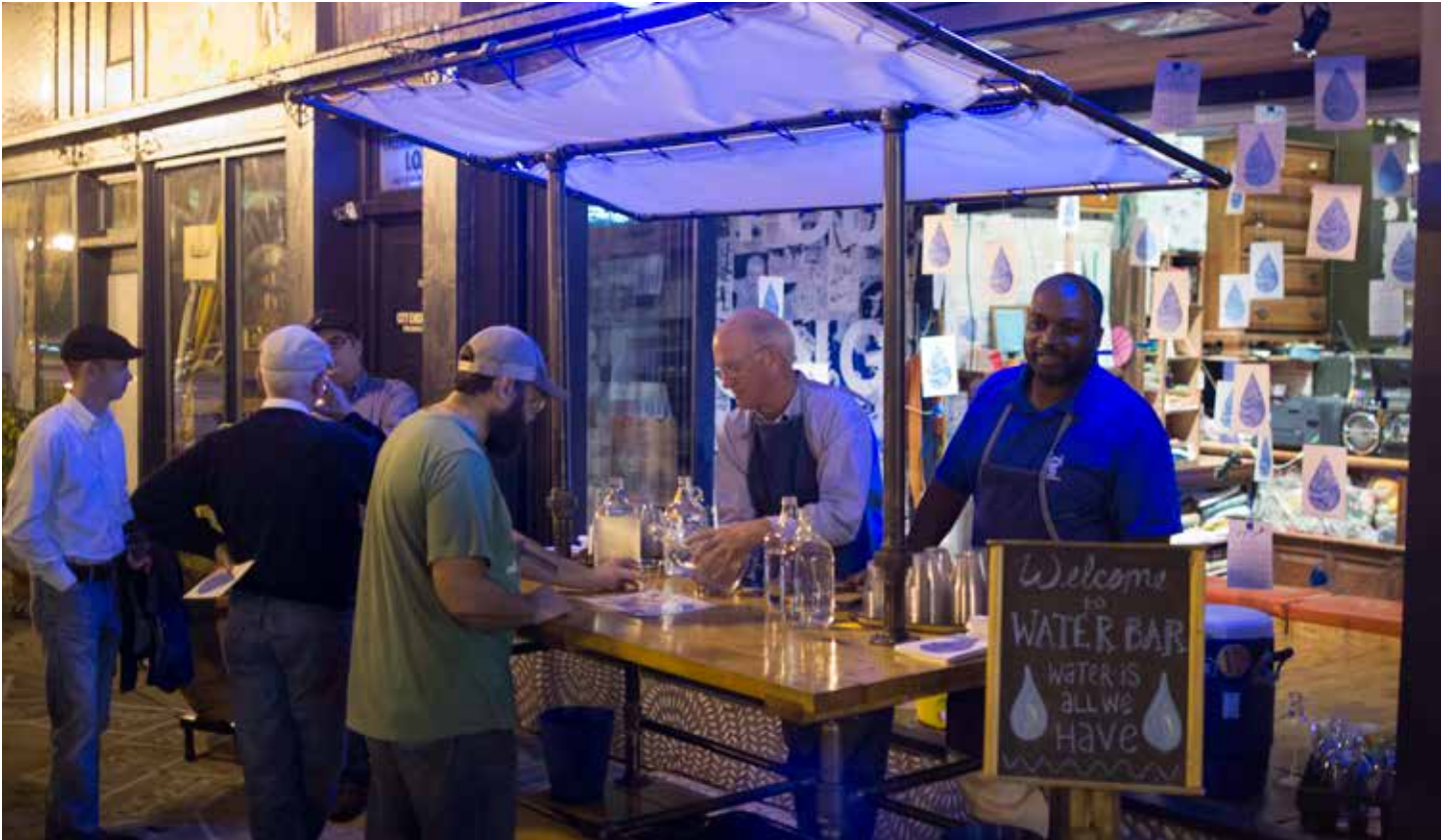
Greensboro Water Resources and Guilford College collaborate to create and staff a mobile Water Bar for Elsewhere's South Elm Projects, Greensboro, NC.