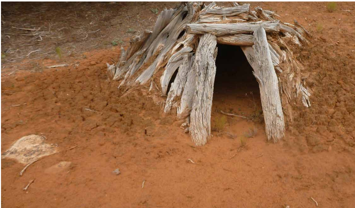
Thousands of Ancestral Puebloan, Ute, Paiute, and Diné sites are well preserved across San Juan County, Utah, but will be at risk should mining and extractive industries be allowed in the region.