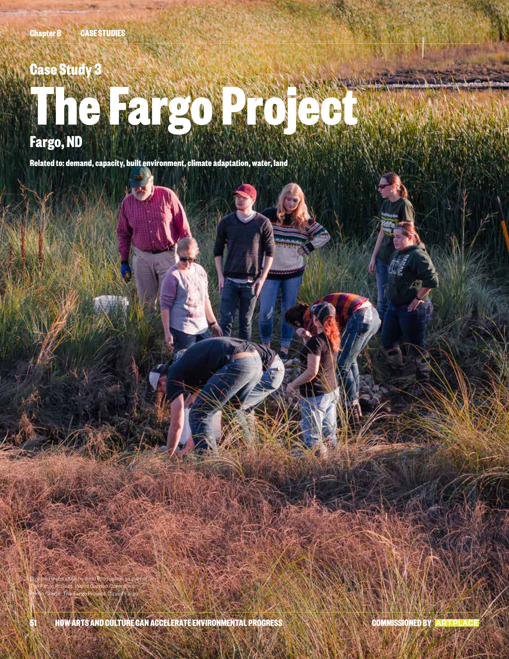
Stream Restoration by Amu Production as part of The Fargo Project: World Garden Commons.

Related to: demand, capacity, built environment, climate adaptation, water, land