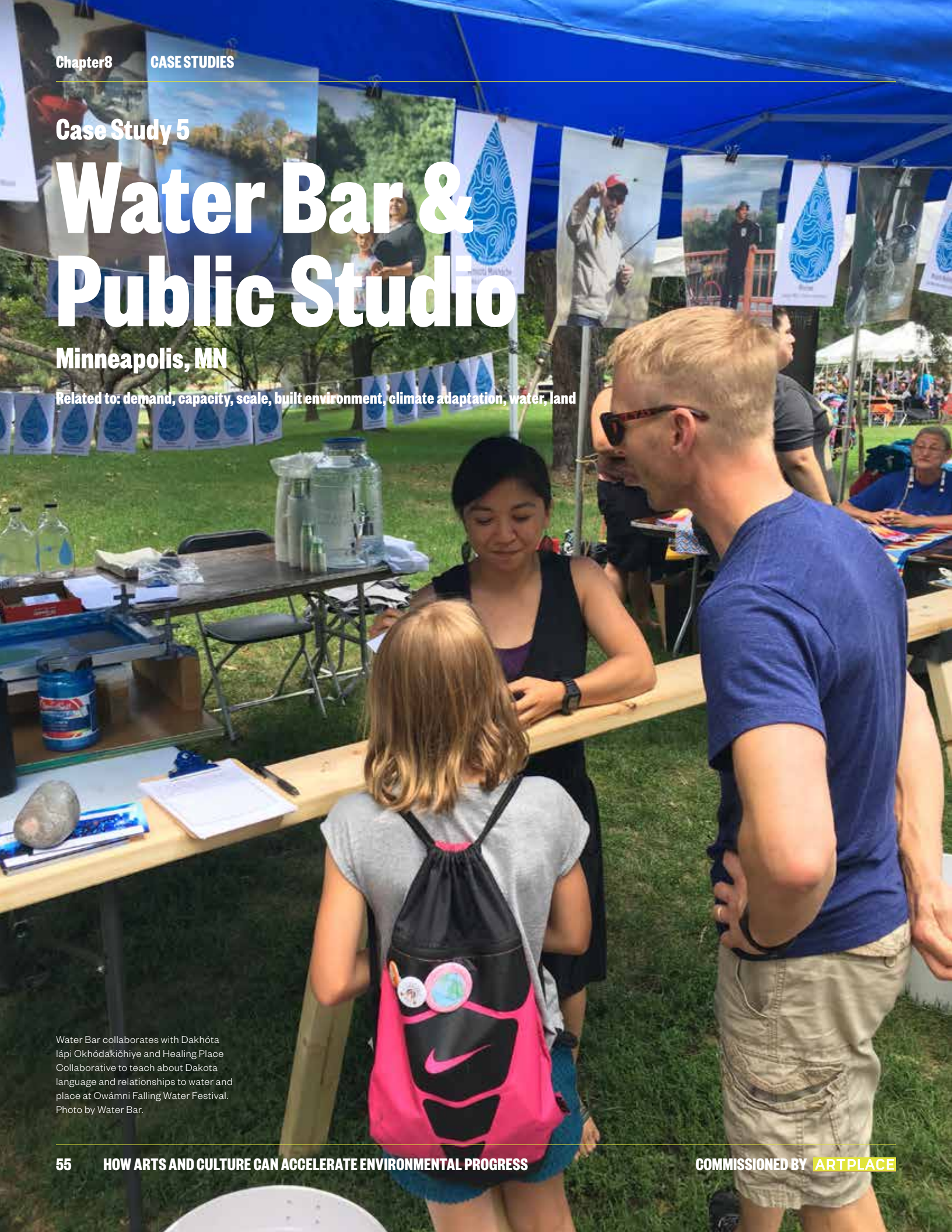
Water Bar collaborates with Dakhóta lápi Okhódakičhiye and Healing Place Collaborative to teach about Dakota language and relationships to water and place at Owámmi Falling Water Festival.

Related to: demand, capacity, scale, built environment, climate adaptation, water, land