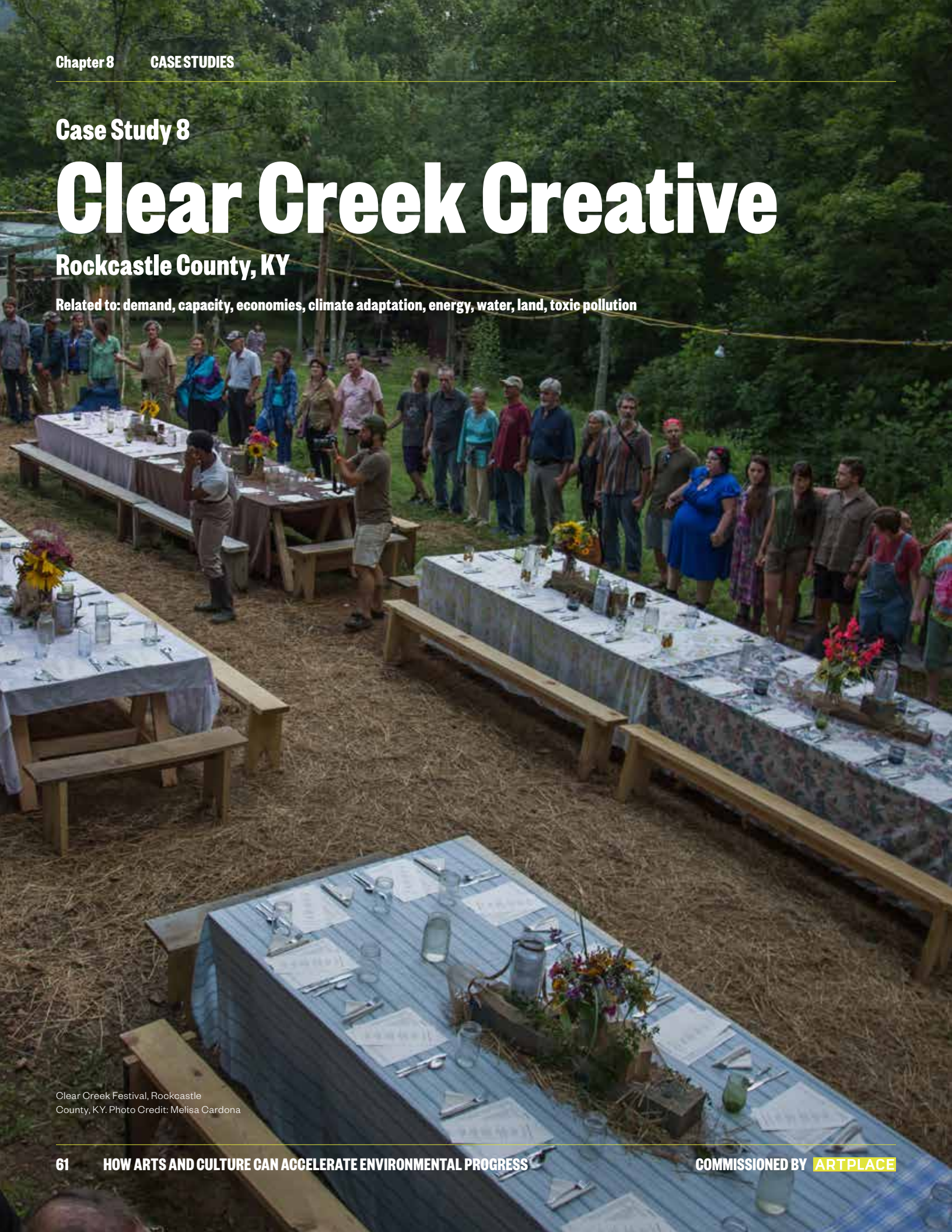
Clear Creek Festival, Rockcastle County, KY.

Related to: demand, capacity, economies, climate adaptation, energy, water, land, toxic pollution