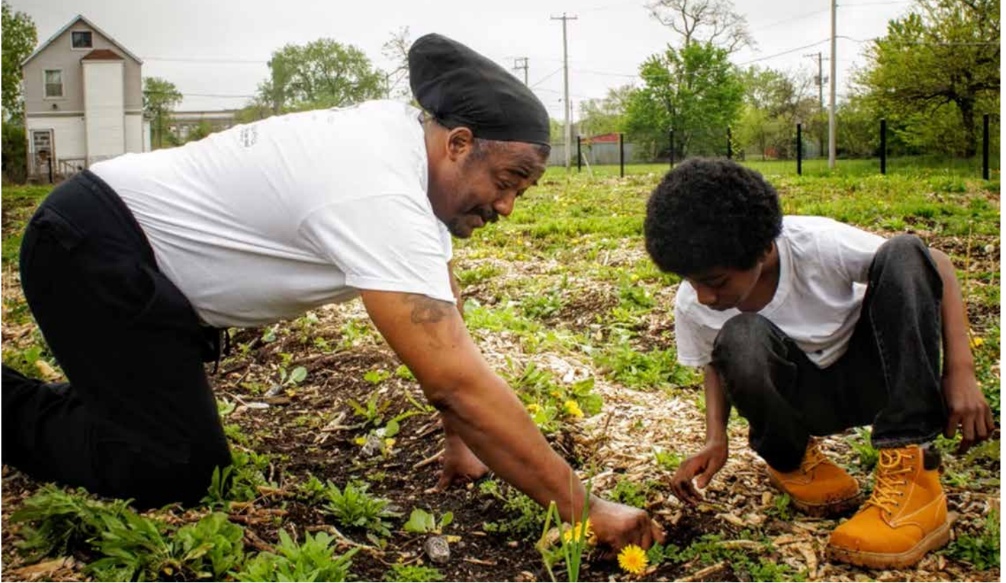
Perry Ave Commons boasts more than four acres of urban farm land, a community garden, and a foreclosed house turned community wellness hub. The transformation was fueled by Sweet Water Foundation's intensive education and career program through which local youth, alongside mentors and elders, transform 'blighted' spaces into economically and ecologically productive community assets.