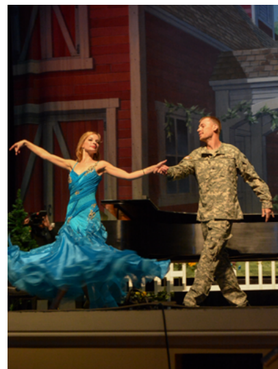
Participants in the 2015 National Veterans Creative Arts Festival.

The National Veterans Creative Arts Festival (NVCAF) is an annual celebration and grand finale stage and art show presented by the Department of Veterans Affairs and the American Legion Auxiliary. Local American Legion Auxiliary branches host talent competitions in visual art, creative writing, dance, drama, music, and more for Veterans receiving treatment in the Department of Veterans Affairs (VA) national healthcare system. Finalists from around the country are invited to take part in the NVCAF.