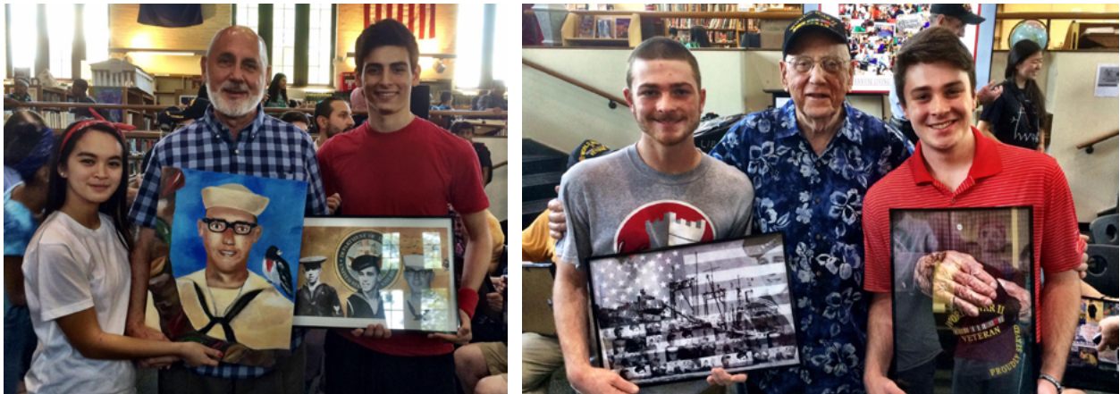
Veteran and student participants in the Living History Veterans Project.