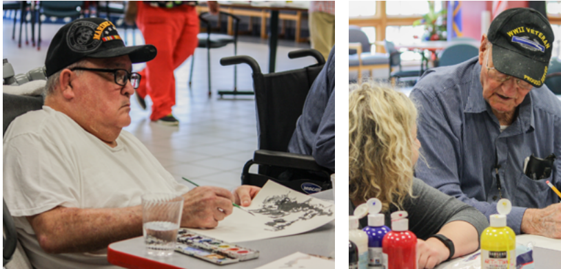
Participants in the Oklahoma Arts & Military Initiative program.

The Oklahoma Arts Council (OAC) began its Arts and Military Initiative as an effort to serve members of Oklahoma's military community, who make up nearly 10 percent of all residents in the state. In partnership with the Oklahoma Department of Veterans