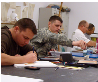
Participants in The Colorado Fine Arts Center's Military Healing Program.

The Fine Arts Center (FAC) has been offering Military Healing Programs for the Colorado Springs community since 2007. The programs are designed to educate the community about the power arts can have in the healing process through a variety of award-winning artistic courses for area Veterans and active-duty servicemembers and their families. Each year, work created in these courses is showcased in exhibits for the community. The FAC also provides military discounts for museums and theater as a Blue Star Program participant.